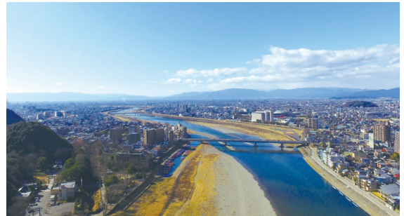
The Nagara River flowing through the Nobi Plain

Gifu is situated approximately in the center of the Japanese archipelago, occupying a total land area of approximately 10,621 square kilometers, or 2.8% of Japan's total landmass. Of this area, approximately one quarter is made up of highlands, which exceeds 1,000 meters above sea level. Gifu has a rich natural environment, with 80.7% of the prefecture covered by woods and forests. The northern and eastern parts are mountainous and the Nobi Plain expands across the southern part, where beautiful rivers flow, converging in the riverside area at sea level.