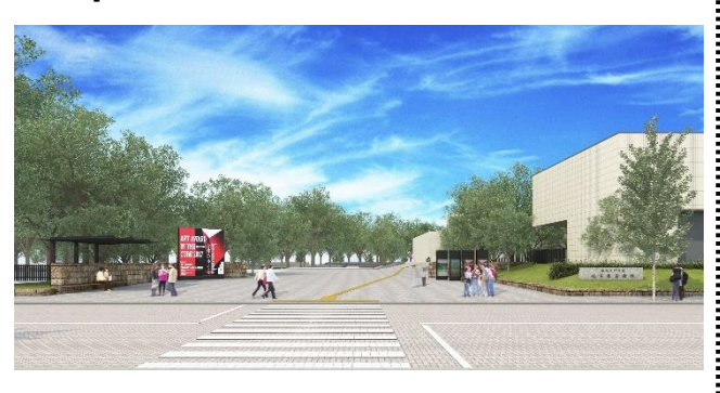
South Gate after renewal (artist's impression)

The Museum of Fine Arts, Gifu, is set to reopen as a more visitor-friendly museum with new facilities including accessible parking and a breastfeeding room. Events will be held to commemorate the reopening on November 3, and the road between the Museum and the Prefectural Library will become a pedestrian-only zone for the Seiryu no Kuni Gifu Autumn Festival Bunka no Mori.