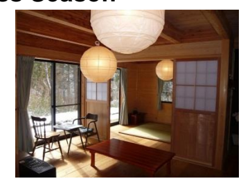
Camp Jomon Cottage (Inside)

Minami Hida Health Dojo а facility which is provides a variety health education and opportunities, practice with the goal of helping