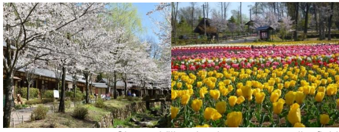
Showa Village's cherry trees, tulip field

Springtime at Nihon Showa Village is bursting with flowers! 1,200 cherry trees blossom and 24,000 tulip bulbs bloom festively across a site the size of sixteen Nagoya Domes. And what's more, with our bargain coupons, you can eat your fill of springtime sweets. This spring, come enjoy a delicious stroll through the Showa Period Village.