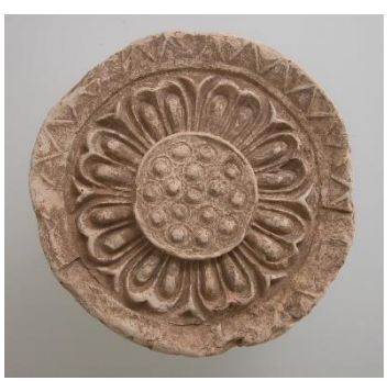
Mirokuji-ato (National Historic Site) Excavated Nokimaru-kawara (rounded roof tile used at the edge of eaves)

The greatest civil war in ancient Japanese history, the Jinshin War (672 CE), and the Asuka period during which it took place, was a significant time for the land of Mino and its people. It was during this era that "Mino