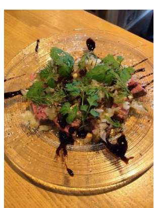
Dishes such as these will be showcased at the fair