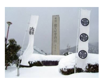
Old battleground at Sekigahara (winter)

We are holding a photo contest to spread the appeal of Sekigahara, the land of Japan's decisive battle, to the whole country. We are accepting submissions from both professional and amateur photographers.