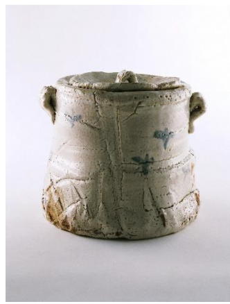
Arakawa Toyozo Shino-mizusashi, From the collection of the Museum of Modern Ceramic Art, Gifu

This exhibition will explore the development of Mino ceramics in the modern era, focusing on the revival of the classical ceramic tradition since the early Showa period. Come and discover the history of Mino ceramics inspired by ancient traditions.