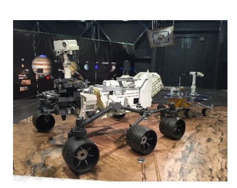
Mars Curiosity Rover

Events for those of all ages to enjoy will be held to commemorate the 1 year anniversary of Sorahaku's reopening after renovations. In